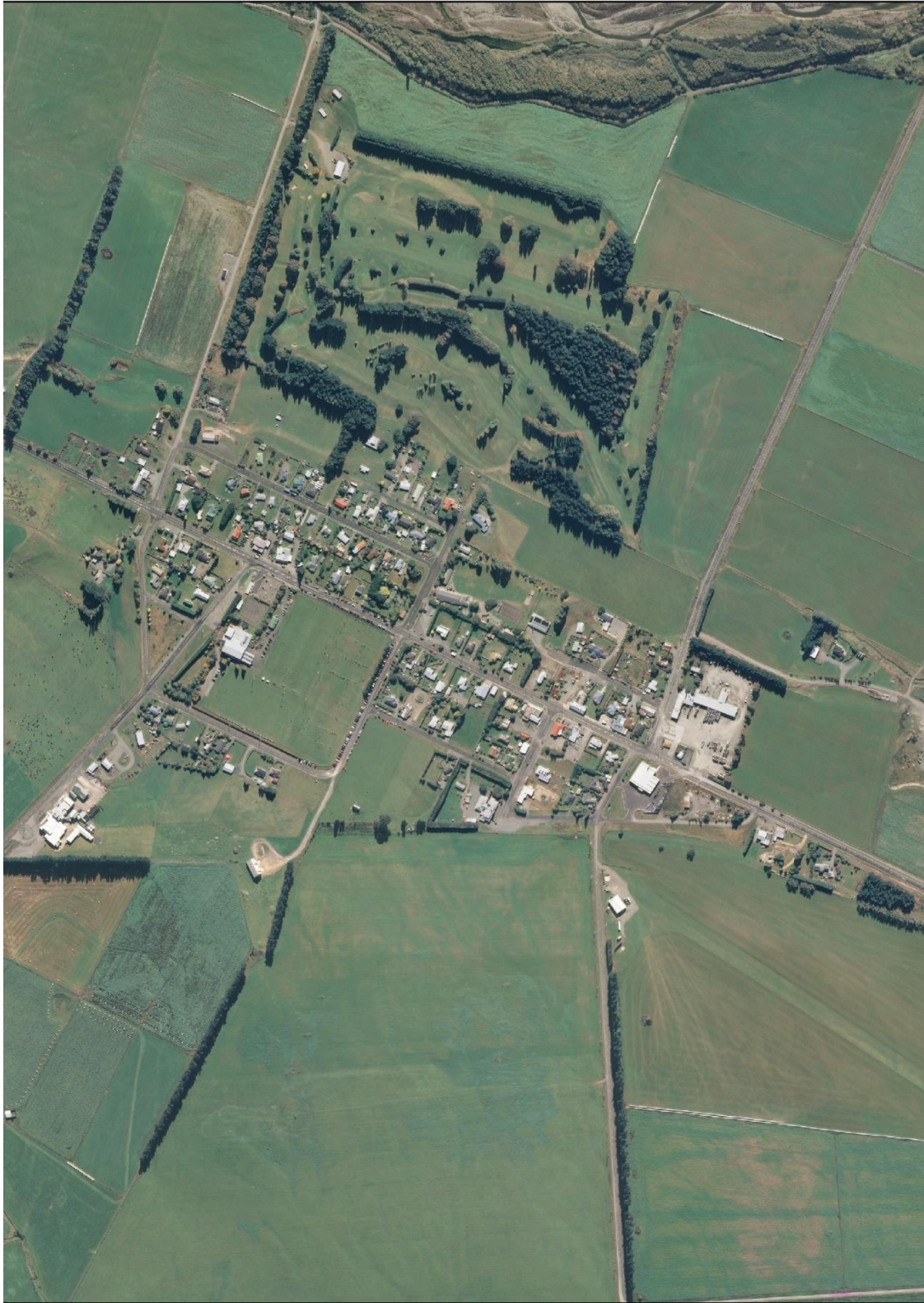
Figure 3: Mossburn Aerial Map